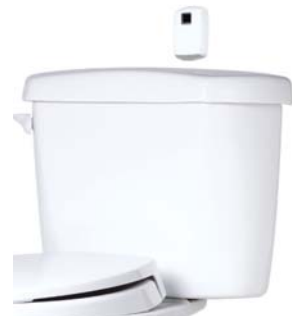
AutoFlush Tank Toilet