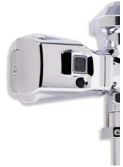
AutoFlush - Clamp