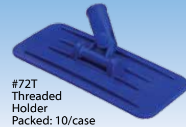
#72T Threaded Holder Packed: 10/case