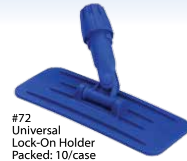
#72 Universal Lock-On Holder Packed: 10/case