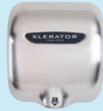
Model XL-SB Surface-mounted, Automatic, Brushed Stainless Steel Cover

Note: Custom Colors Available (visit our web site for more information)