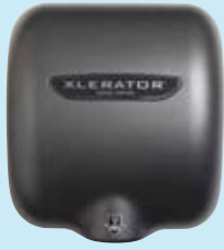
Model XL-GR Surface-mounted, Automatic, Graphite Textured Painted Cover