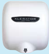
Model XL-BW Surface-mounted, Automatic, White Thermoset (BMC) Cover