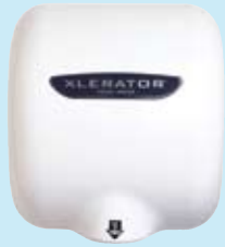
Model XL-W Surface-mounted, Automatic, White Epoxy Painted Cover