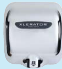
Model XL-C Surface-mounted, Automatic, Chrome Plated Cover